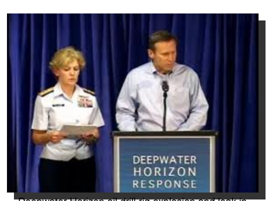
Deepwater Horizon oil drill rig explosion and leak Gulf of Mexico, 2010, was example of poor communication, as news kept changing and getting worse over several days, weeks