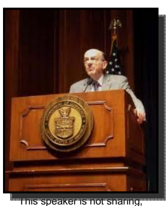
dialoguing, or listening