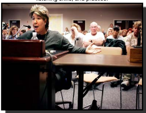
rou don't want to be facing this group wit

Facing this angry crowd takes patience, good listening skills, and practice!