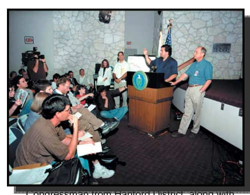
Secretary of Energy, meet with public, 2000