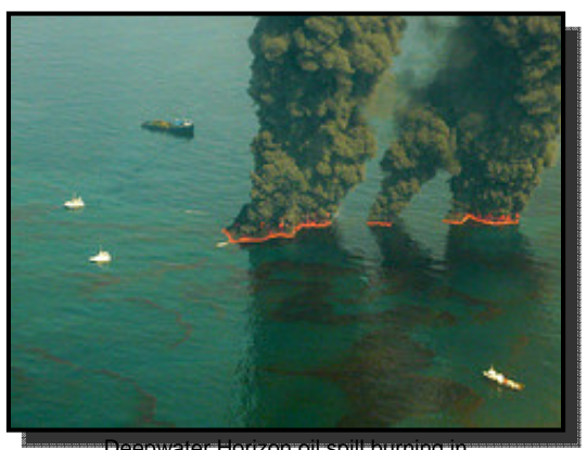
Gulf of Mexico, 2010

URS Experience in Public Involvement and Stakeholder Outreach