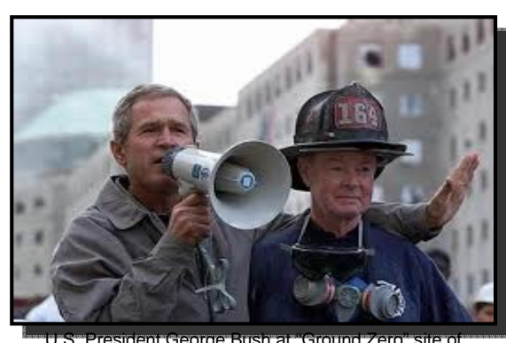
resident George Bush at "Ground Zero World Trade Center attacks, New York City, 2001