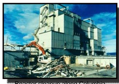
River shoreline, Hanford Site