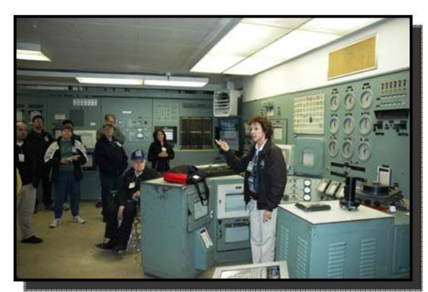
Hanford Site public tour in historic B Reactor, 2009