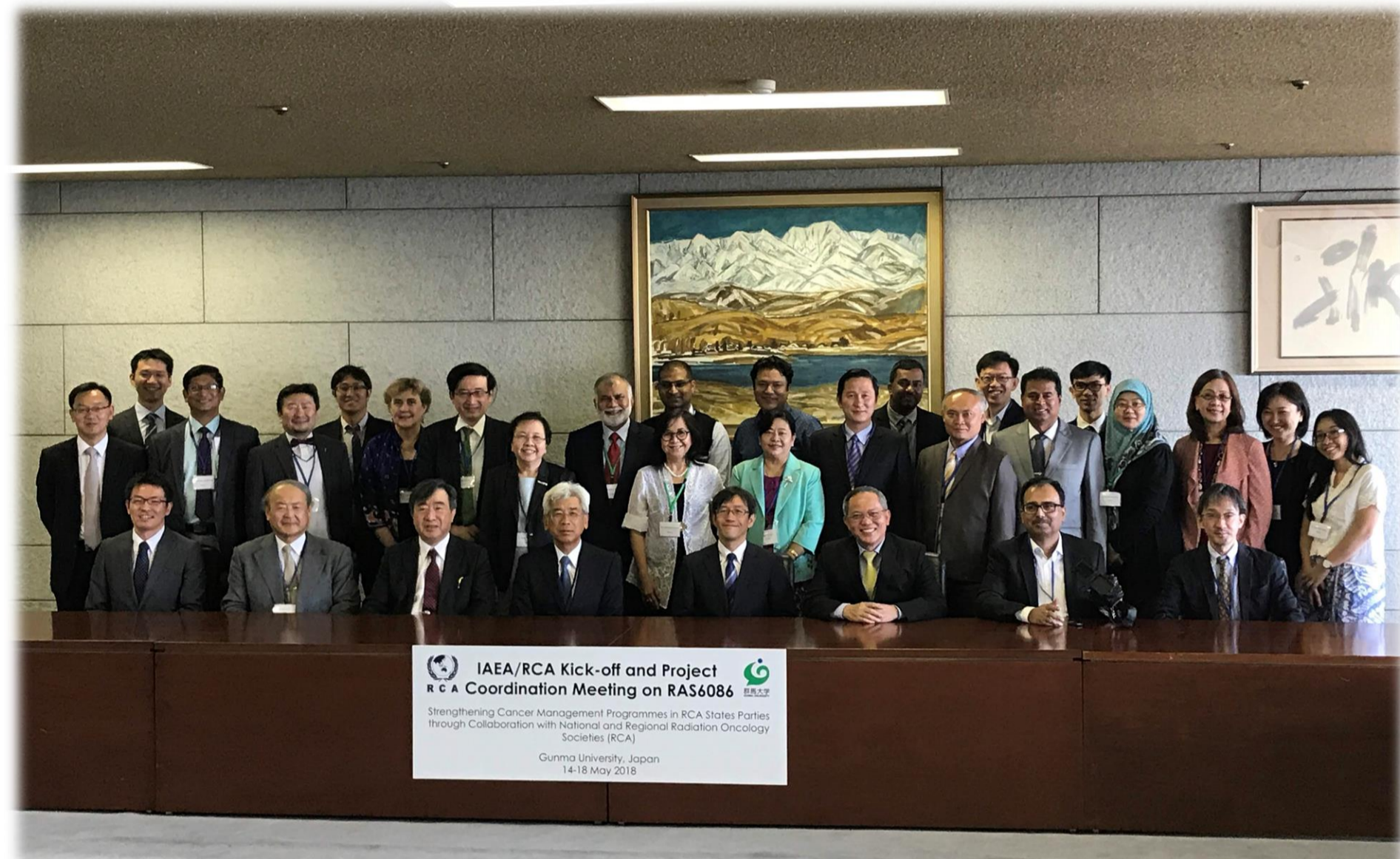
← Kick-off Meeting on RAS6086 (a project to strengthening cancer management programmes)