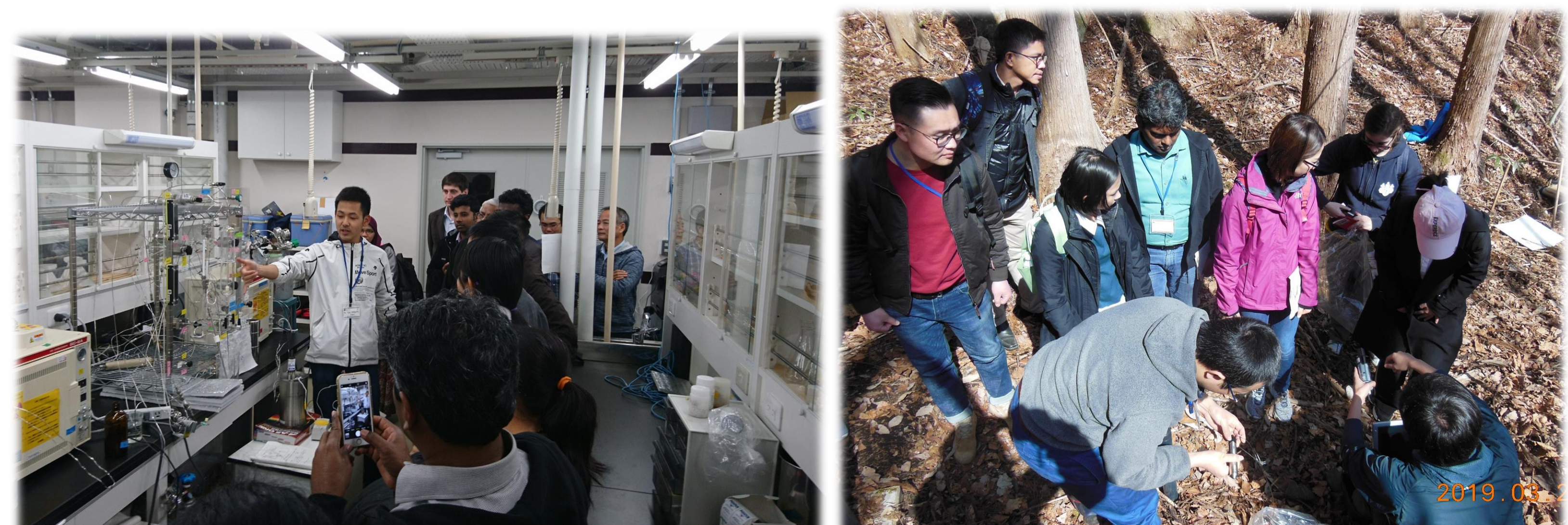
Regional Training Course for assessing groundwater resource in Tsukuba