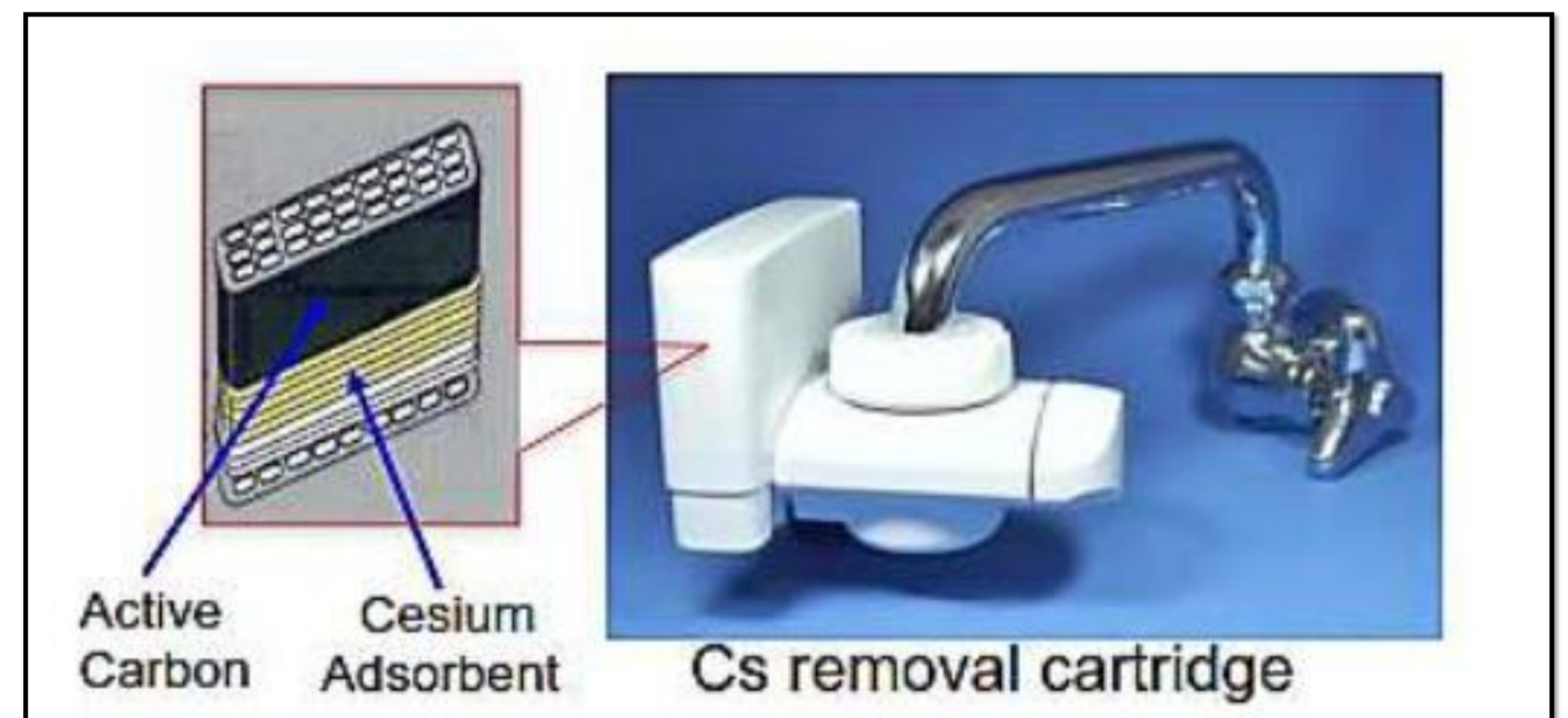
↑ Products developed under the RCA project on radiation processing