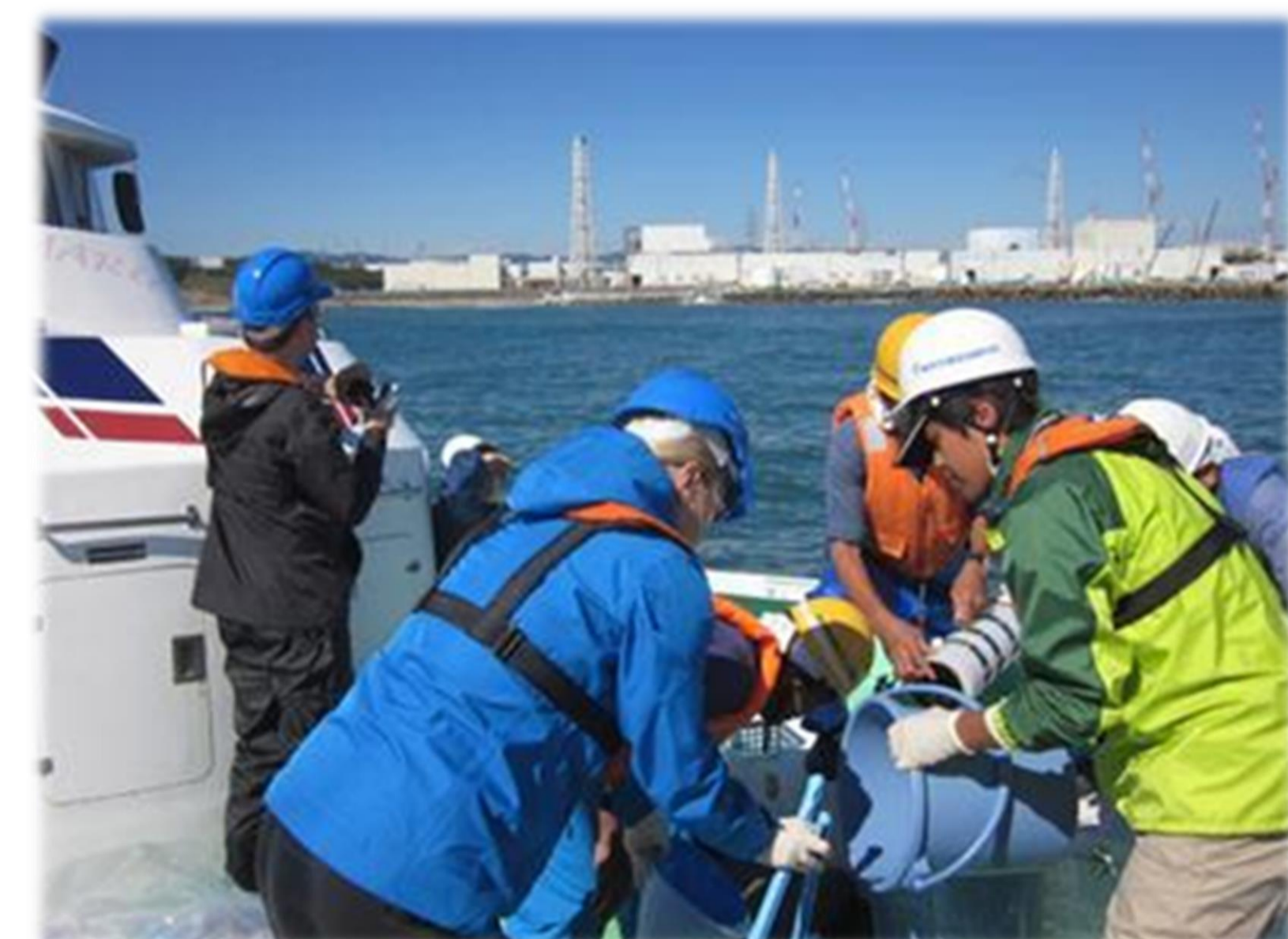
Collection of seawater samples for project on Marine monitoring (RAS7028)