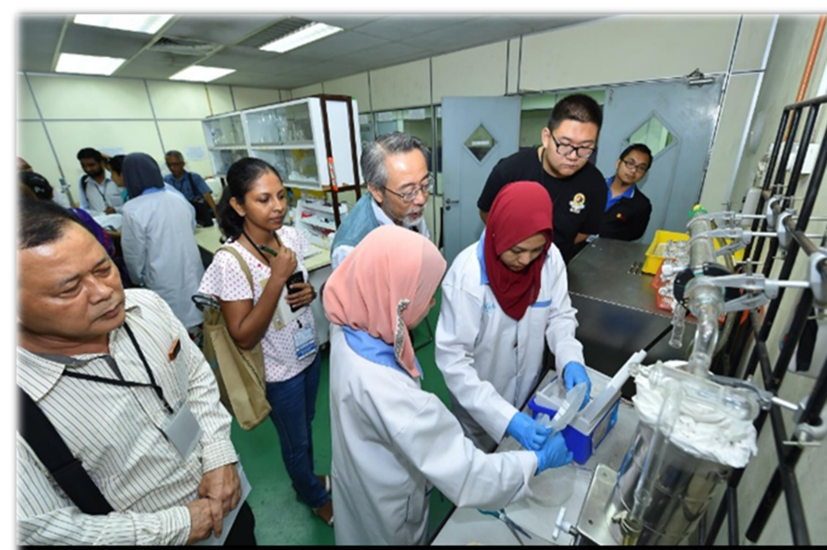
← Regional training course on advanced characterization methods of grafted polymeric