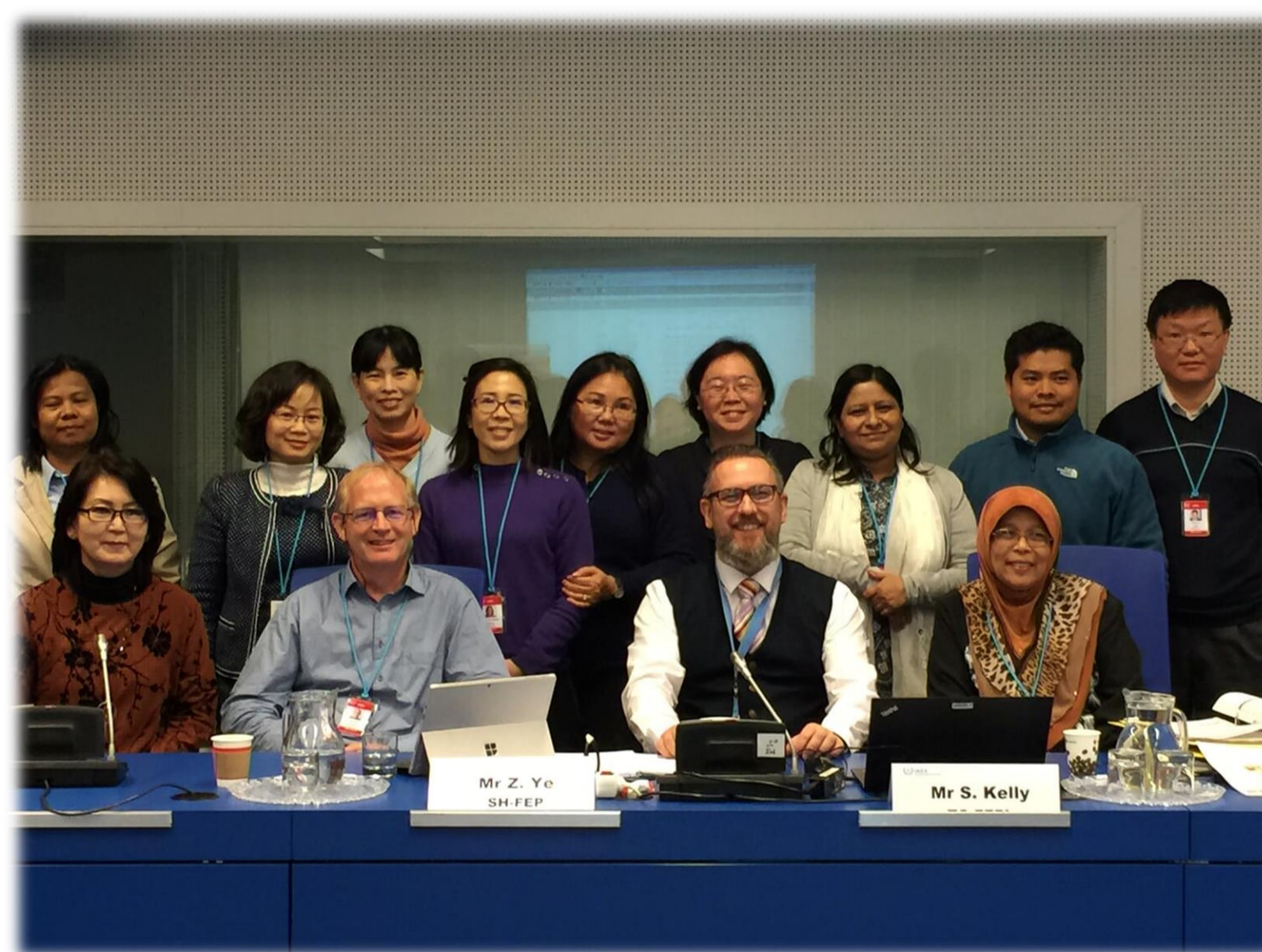
↑ Kick-off Meeting of projects on Authentication of Foodstuffs (RAS5081)