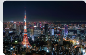
Supply Power at Night

Powering the Night with Yesterday's Sun - and Tomorrow's Innovation.