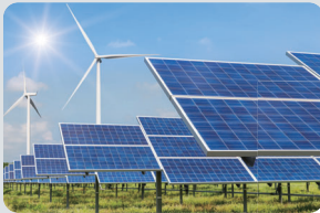
Charge during Day