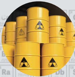
High-Level Liquid Waste