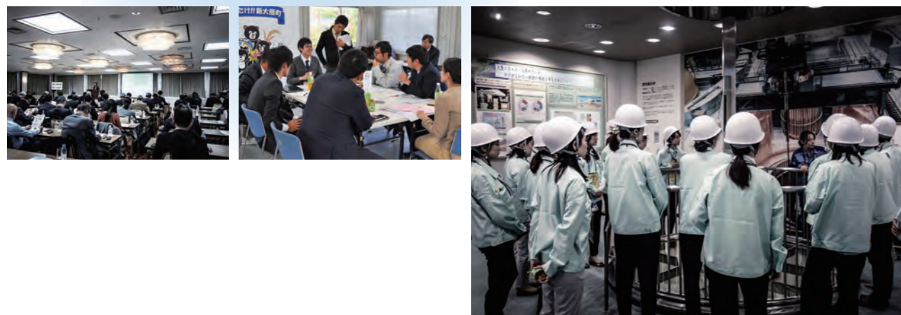
Site tour to nuclear facilities

To help people better understand the benefits and potential of nuclear energy, including its significant contributions on climate change issues and toward sustainable development of society for future generations, JAIF provides timely information by using various media and hosting symposiums on a regular basis. A particular current focus of activities by JAIF and its member companies is the restoration of public confidence in nuclear energy lost as a result of the accident at the Fukushima Daiichi NPPs.