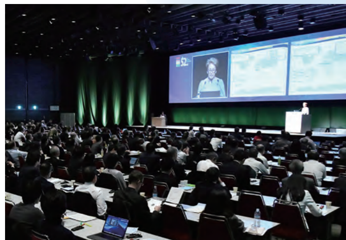
The JAIF Annual Conference

JAIF is engaged in a wide range of international activities based on strong relationships it has established with overseas counterparts and organizations over many years. To help strengthen the foundation for nuclear energy uses, maintain the vitality of the nuclear industry, and increase Japan's presence in the global nuclear community, JAIF promotes information and human-resource exchanges with various countries as well as international bodies.