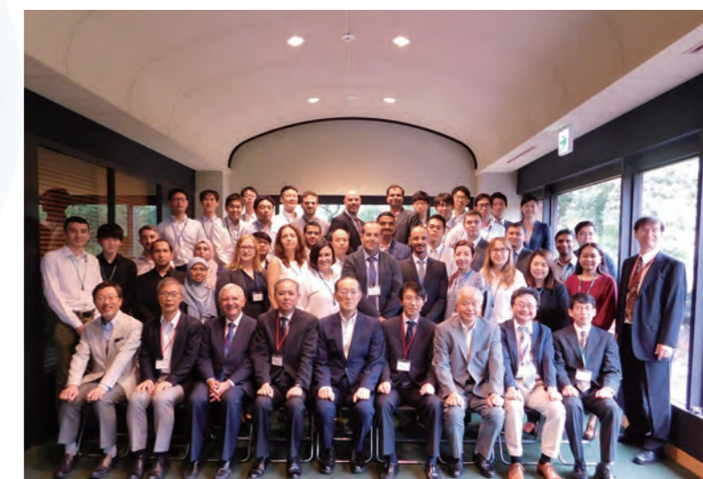
Japan-IAEA NEMS organized by JN-HRD.Net